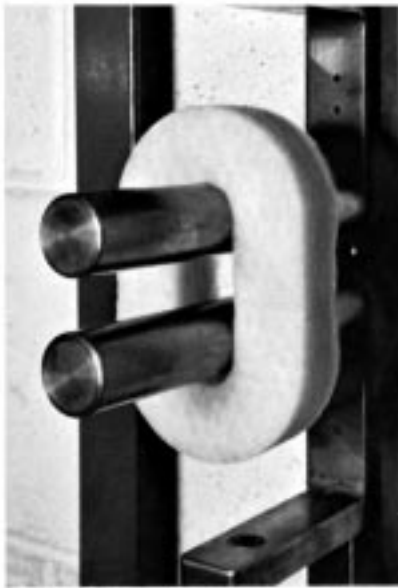
FIG. 2 Post-Type Grips