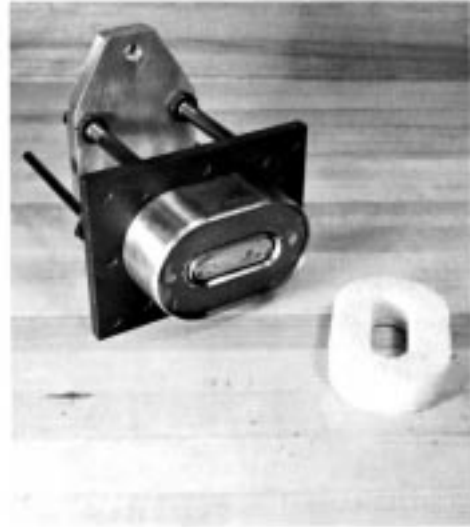
FIG. 3 Specimen Die Cutter