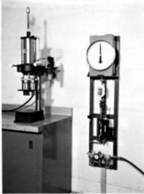
FIG. 1 Tension Test Unit